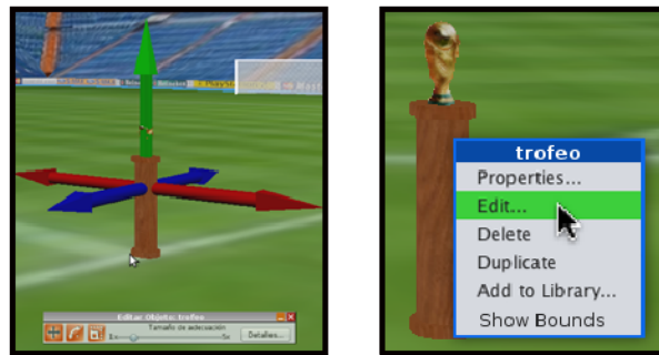
Figure 2: Editing an asset's properties in Open Wonderland.

The next step is to use the WoQ-editor (see figure 3) to define each question, specifying its wording, possible answers, correct answer and feedback, and to relate all these fields to the assets previously added to the virtual world. The editor allows the inclusion of hints , which can be used to help students to identify the places and objects in the 3D world where wordings are provided.