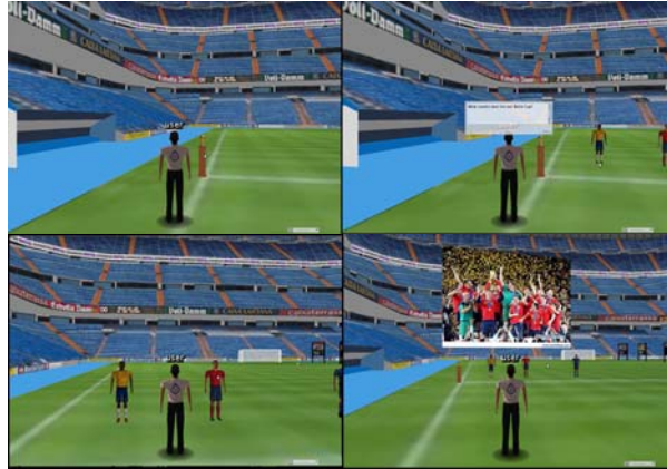
Figure 1: Deployment of the question (“Who won the last Football World Championship?”)

Once all the necessary assets have been properly placed in the world, the next step in the authoring process involves the creation of a new snapshot. A snapshot is a copy of the current state of the virtual world. That copy will be used later as the setting for the delivery of the questions.