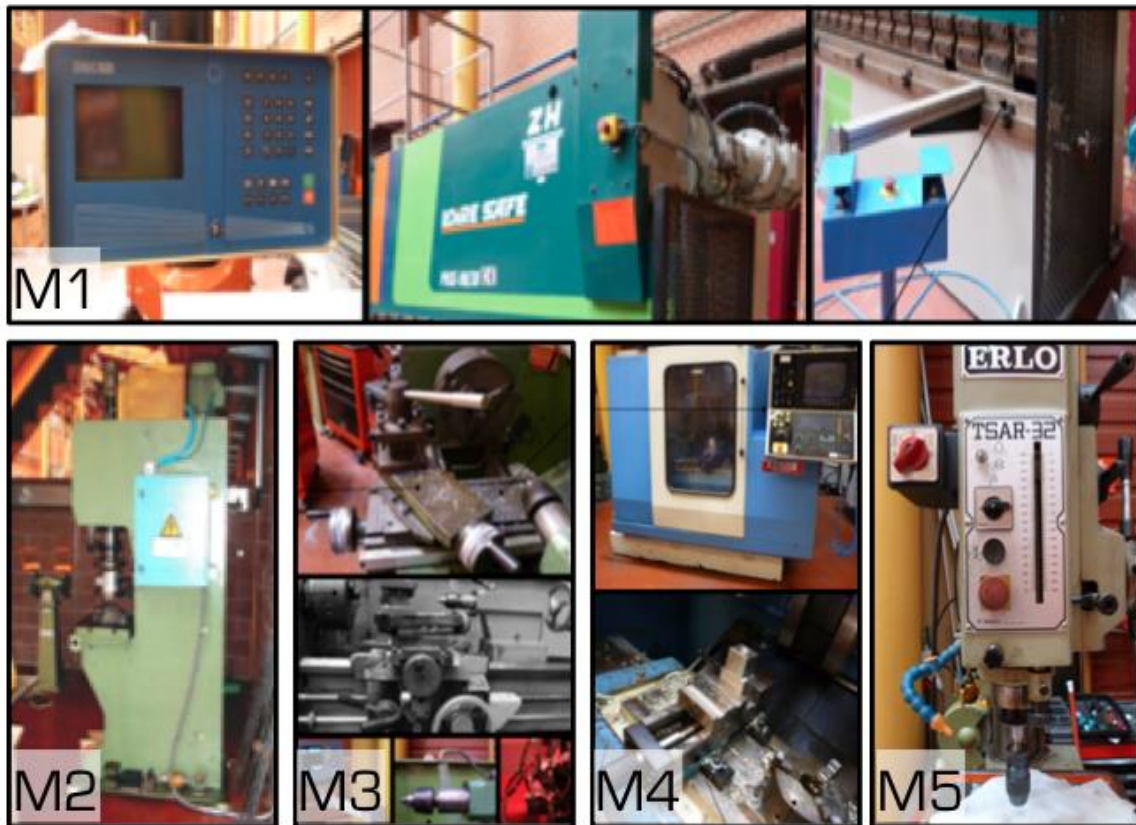
Fig. 1 Pictures of the five industrial machines: Hydraulic Press (M1), Punch Press (M2), Numerical Control Lathe (M3), Machining Center (M4) and Vertical Drilling (M5).