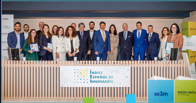
ÍEI 2023, group of award winners