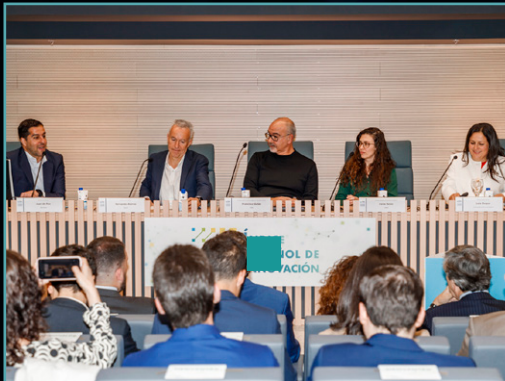
ÍEI 2023, panel of Spanish award winners