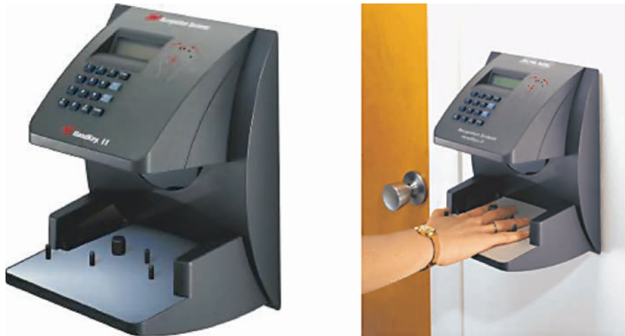
Hand Geometry. Figure 1 HandKey II device and illustration of its use as a door lock in a physical access control system [1] (Images published under authorization of Schlage Recognition Systems).