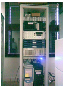
Figure 1. Photograph of the servers’ room

The “advanced telematic applications” course at the Carlos III University of Madrid is dedicated to teach third year Telecommunication Engineering students how to configure network services such as DNS, NFS, NIS, SMTP and HTTP. The course is equally divided with theoretical lectures (30 hours) and applied labs (30 hours). The main competency targeted by the course is that students are capable of configuring and administering the Intranet and Internet services of a small company using Linux based servers and services. To motivate students, the configuration of the network inside the Telematic Engineering department at the Carlos III University of Madrid is used as a related, nearby working example. In fact, some of the theoretical lectures are based on describing slightly modified configuration files of the working services in that department’s network while some of the labs are just reduced versions of that services. Fig. 1 shows the servers’ room in which the network services run.