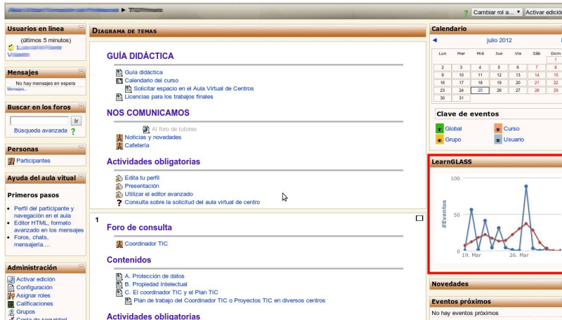
Fig. 2. Home page of a Moodle course as seen by a learner. The visualization embedded by our solution is highlighted in red.

more detail in [7] where the possible solutions are also included. For this implementation we have previously imported the Moodle user identifiers into GLASS database and mapped each Moodle account to its corresponding GLASS account.