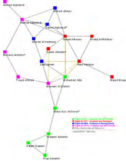
Figure 3: 11S Social Network.