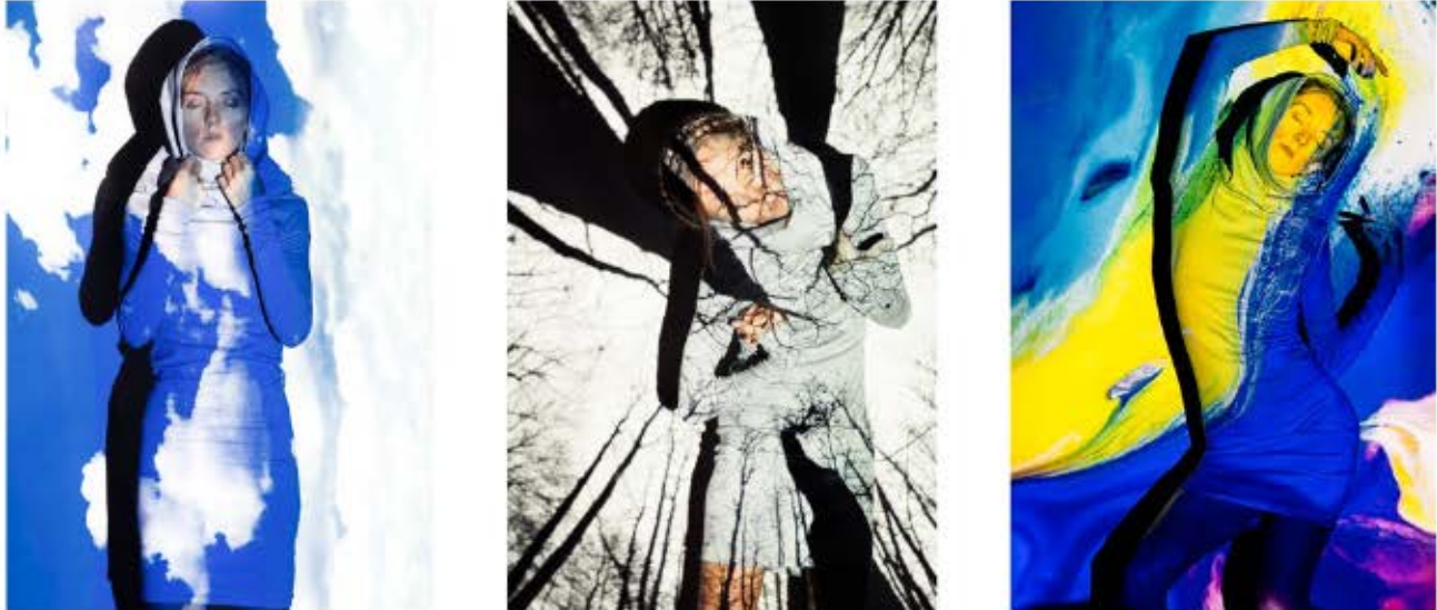
Fig 1. Magic Lining concept photos representing sensory-feedback, integrated in the inner layer of the garment, changing the perceived “material” of the body.

stimulation, which has already been used in the rehabilitation of movement disabilities (Inventions, 2019). Teslasuit (2018), is a bodysuit that utilises fine-tuned location-specific electric stimulation of the skin to deliver haptic feedback directly to the entire body. Hardlight VR suit (2017) follows the same whole-body concept, but instead using a force feedback approach. Versatile Extra-Sensory Transducer (Eagleman et al. , 2017) can take in diverse types of real-time data—from sound waves to help the deaf, to flight status, even stock market trends—and translate this data into dynamic patterns of vibration in its motors (Keller, 2018).