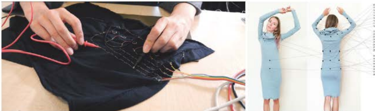
Fig 2. Left: first prototype of Magic Lining , allowing the user to experience a series of vibration motors delivering sensation patterns to the body through textile. Right: The vibration motor positioning on the final prototype. For a video describing the project and process: https://vimeo.com/289294125

To obtain first-hand experience of the potential of soft vibrotactile materials, our team proposed to develop a dress capable of changing the wearer's perception of their own body. We followed an iterative design process, producing three prototypes and two user studies on the effects of various textile vibration patterns on body-perception (spatial haptic metaphors). This led to the production of a fully functioning prototype garment (Figure 2).