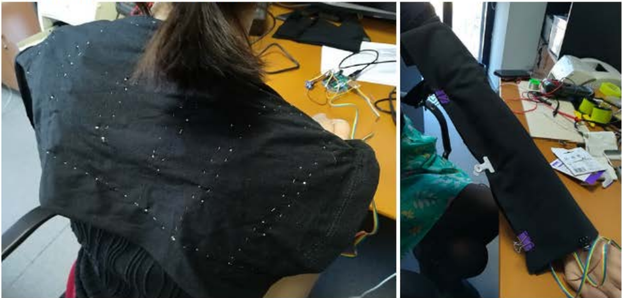
Fig 3. The second prototype of Magic Lining allows the user to sense vibration movements from one end to another, inside out and outside in, on the back and around the arm.

creating sensations around the arm or on the back. We also wanted to explore the possibility of having the pattern of vibrations move gradually about the body. To achieve this, our next step was to create a 3 x 7 matrix of vibrotactile material.