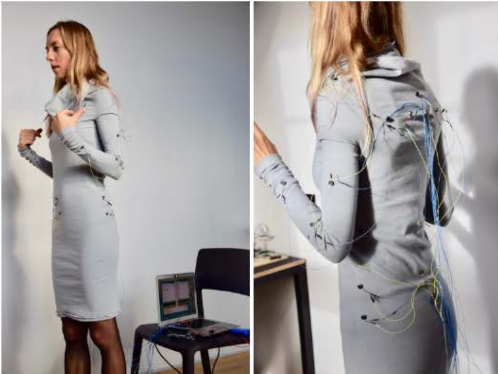
Fig 6. The inside layer of the final prototype of Magic Lining allows the user to feel as if she/he is made of three different materials: air, water, rocks. A professional dancer is shown experiencing the prototype in these photographs.

We invited an acting professional dancer to experience the sensations the dress evoked in her (Figure 6). She expressed clear sensations of feeling calmer or more nervous when the vibration patterns were switched. This was reflected in her way of speaking, the tonality of her voice, speed of movement and body language. She described mental images of composers and pieces of music that specific vibration patterns brought to mind.