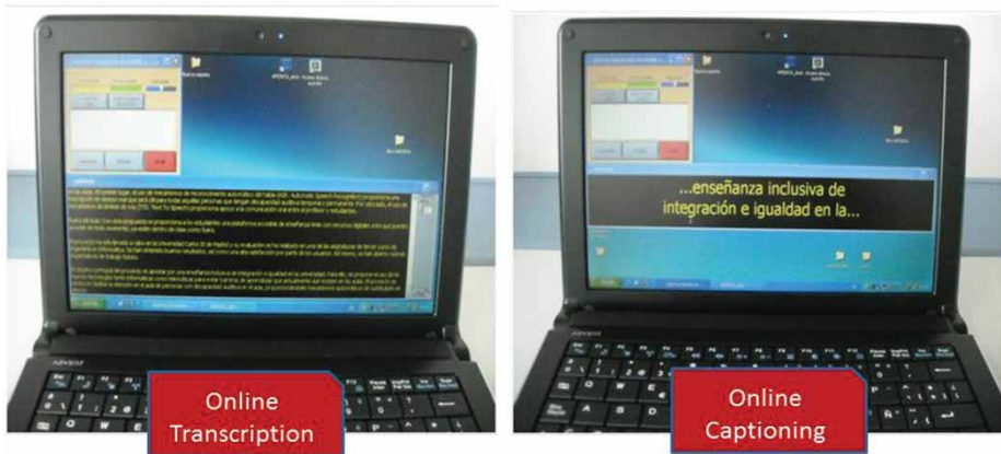
Figure 3. Transcription (left)/caption (right) in laptops.

In addition, after each 50-minute lecture (at university or at school), students were asked to answer some survey questions measured in a five-point Likert-type Scale (Brooke, 1996). All the students completed the survey voluntarily and some of them provided written comments about improvements and satisfaction to the inclusive initiatives.