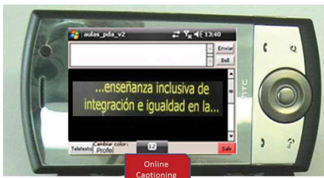
Figure 4. Captions in the PDA.