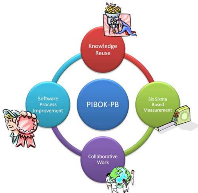
Fig.I 2. PIBOK-PB Model